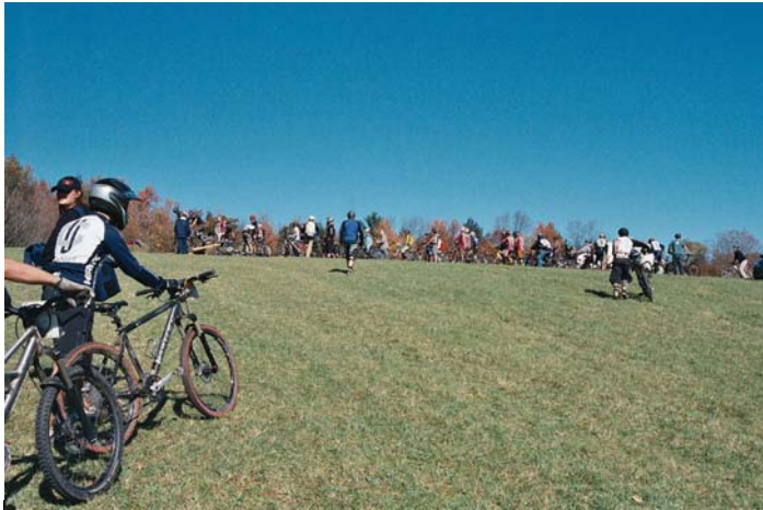
Above: The line for the DS Start Below: Start-finish of the cross-country race. Redbull supplied the finish line archway

The cross-country and dual slalom events were held at Holiday Farm in Dalton, MA. The Cross-country featured a semi-technical course on 90% fast single-track, some smooth fire road and an over-under- technical element where riders crossed over an earlier part of the course on a small bridge. There were plenty of fast sections for the roadies, and technical rocky sections and bridges that appealed to the mountain biker in